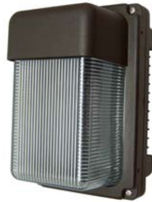
Half Cutoff Frame Wall Light

Photocell: Field Installed 120V or 208-277V