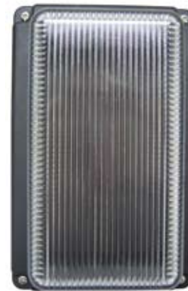
Open Frame Wall Light