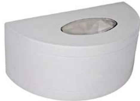
Round Architectural Up & Down Wall Light