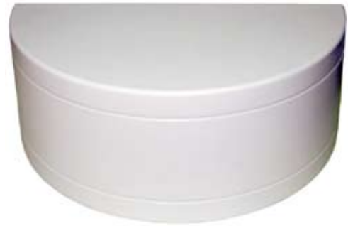
Round Architectural Down Wall Light