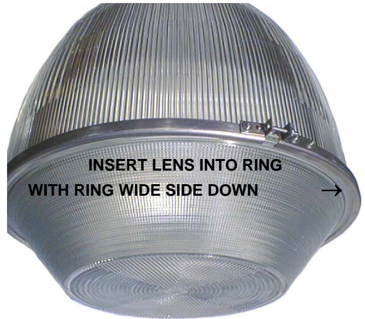
DETAIL: LENS RING CROSS SECTION